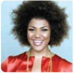
Soprano Measha Brueggergosman.