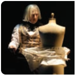
Playwright-actor Robert Lepage, in Ex Machina's production of The Andersen Project, based on the work of Hans Christian Andersen.