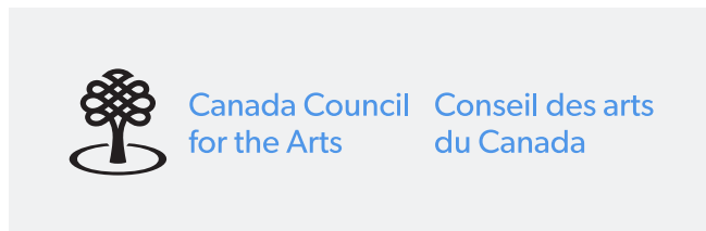
On a light background