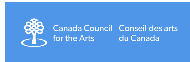
White on dark coloured background